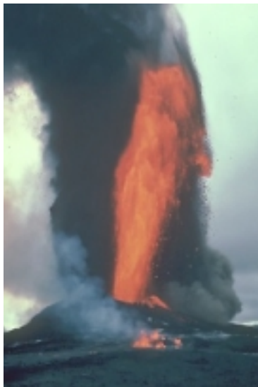
Heat from the Earth's interior is known as geothermal heat.

People have known since ancient times that the Earth's interior is very hot. The temperature of the Earth's core is estimated to be between 3000 and 5000° C (scientists are still not sure what the exact temperature is). This heat is generated by the slow breakdown of radioactive elements, and by the immense gravitational pressures acting on the rocks and minerals of the Earth's interior. Temperatures in excess of 500° C can be found in the Earth's crust just a few thousand metres below the surface, but geothermal heat right at the surface of the land is barely detectable.