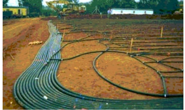
A view of a ground source heat pump used for heating and cooling a home.

By reversing the flow of the refrigerant, the heat pump system can cool the house in summertime. Heat collected from inside the house can be released back into the cool soil, resulting in a highly efficient air conditioning system for the home. A ground source heat pump requires some electricity to run the