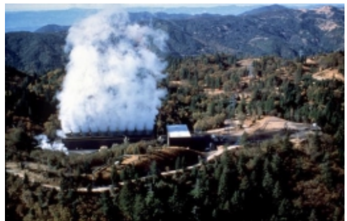
A geothermal heat utility.

The temperature of the soil below about 2 metres remains constant regardless of the weather or season. In most places throughout southern Canada, soil temperatures at this depth hover between 5 and 10° C.