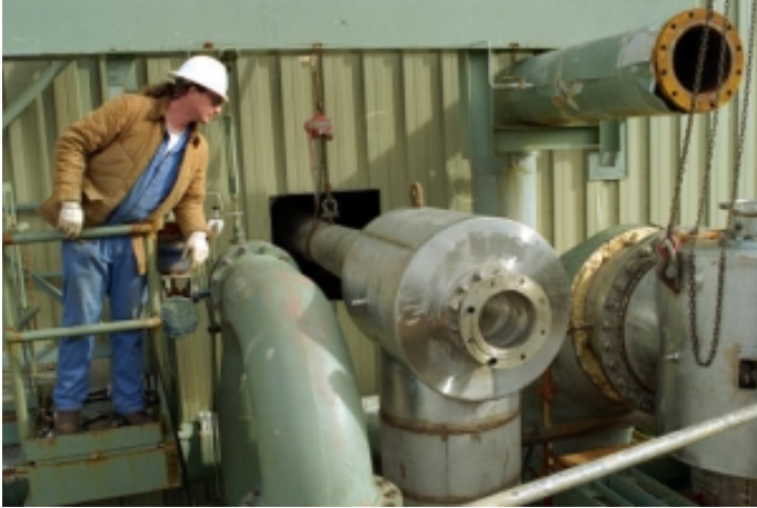
Geothermal steam can be used to make pollution-free electricity.

The difference between air and deep soil temperatures can be used for heating and cooling in a very efficient manner, with a ground source heat pump, also called a geothermal heat pump.