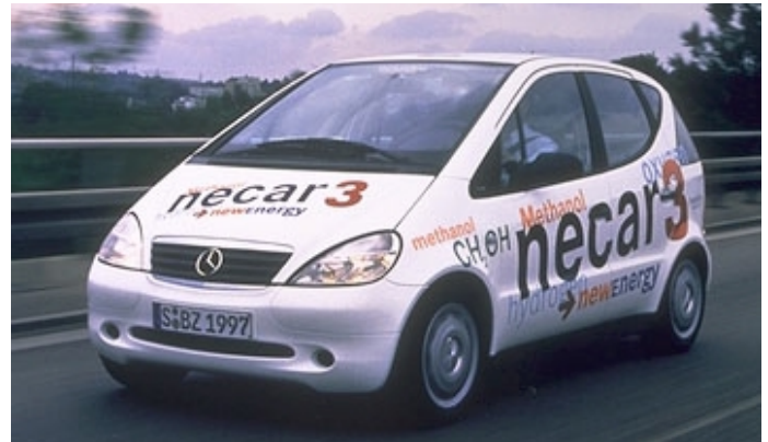
A fuel cell car designed by Daimler-Chrysler.

Fuel cells require complex systems for cooling, and for containing hydrogen gas, which leaks freely from most ordinary containers.