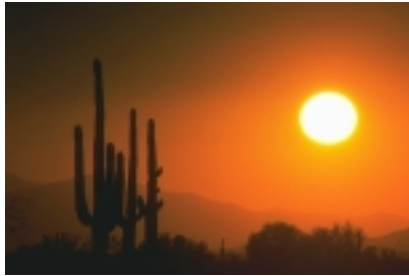
The sun is the ultimate renewable energy source.

The sun is the ultimate renewable energy source. Every day for billions of years the sun has been pouring out unimaginable amounts of energy. The Earth, orbiting at a distance of 150 million kilometres from the sun, intercepts a tiny fraction of this solar output.