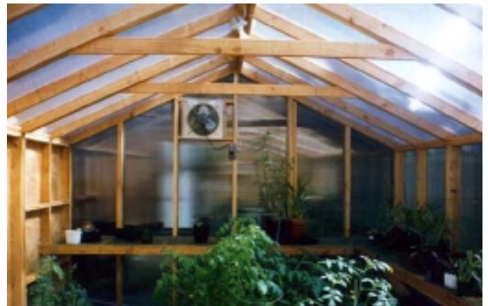
A greenhouse uses sunlight to trap heat, giving young plants a head start on the growing season.

A good example is a greenhouse. Greenhouses are designed to allow sunlight in, and then trap heat so that young plants can get a head start in the growing season. The glass of the greenhouse lets in lots of sunlight, which is absorbed by the plants, floor, soil, and other dark surfaces inside. As these surfaces